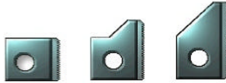
00 & 100 SERIES DIE HEAD CHASERS